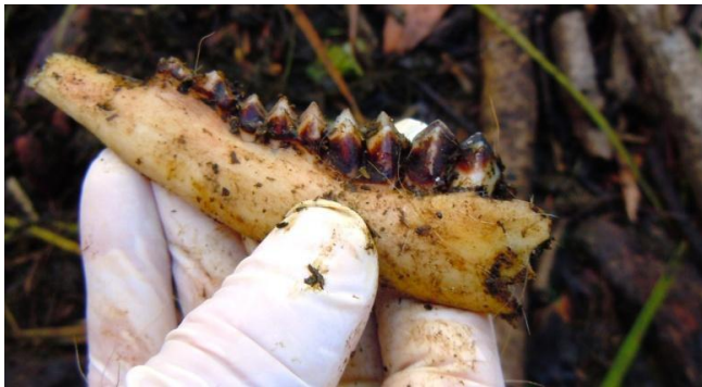
Leftovers from FP194's feast. Studying a deer's tooth eruption and wear can yield clues to its age.