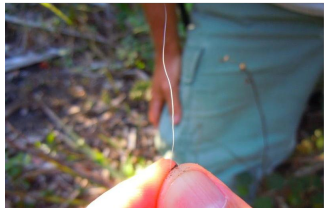
Upper: Picking through the flattened leaves and trampled soil of a panther daybed to find hairs or paw prints for verification. Lower: A white hair from FP183's belly: hard (soft) evidence of a bed site.

Florida Panthers hunt at dawn and dusk. They rush short distances and spring at their prey. They kill by a bite to the neck or skull. An adult male typically consumes larger-sized prey (e.g., white-tailed deer) every 8 to 11 days, while an adult female with kittens may consume large prey more often. After the first meals, panthers "cache" their prey by putting debris over the carcass. Panthers may return to feed on the same carcass over several days until they are ready to move on or the carcass has become too rancid to consume. Currently the Florida Fish and Wildlife Conservation Commission is engaged in a prey study under the direction of Dr. Dave Onorato. Watch for Dave's article with more specifics on the study in the February Panther Update issue.