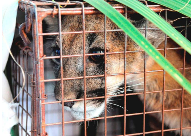
In Flight to White Oak, the BCNP Team Lifts the Cover on K304's Cage to Check on His Status.