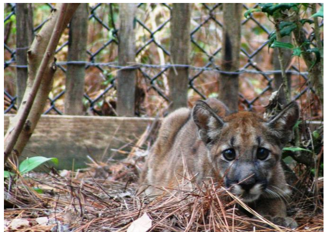
Five-Month-Old K304 at White Oak Conservation Center, November 2, 2010.