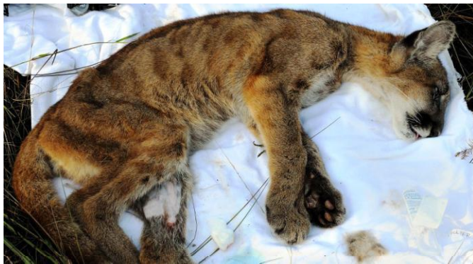
Orphaned K304 at Capture on October 30, 2010.