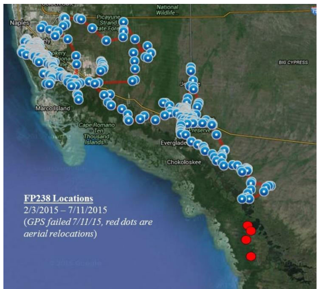
Figure 3. FP 238 Telemetry locations since capture 2/15. FWC

Young males dispersing out of their mother's home range often try to establish a home range in marginal habitat (the prime areas are defended by adult males). FP 238, a young male, captured in the Port Royal subdivision in February 2015 (Panther Update March 2015), has spent most of his time west and south of US 41 since his capture. He was released in Picayune Strand State Forest and headed south, and crossed US 41 within days. He spent a lot of time in Rookery Bay National Estuarine Research Reserve. Then he traveled southeast, between US 41 and the mangrove forest, through Collier Seminole State Park and Fakahatchee Strand Preserve State Park. He then spent some time in the area between Everglades City and Jerome on SR 29. Lately, he is back utilizing the edge of the mangrove forest, heading south into Everglades National Park to Lostmans River. Primary panther habitat is mostly above US 41. His travels illustrate the value of native habitats, not included in the identified panther habitat zones, especially to young maturing panthers. Unfortunately his collar failed in early October and biologists are no longer able to track him.