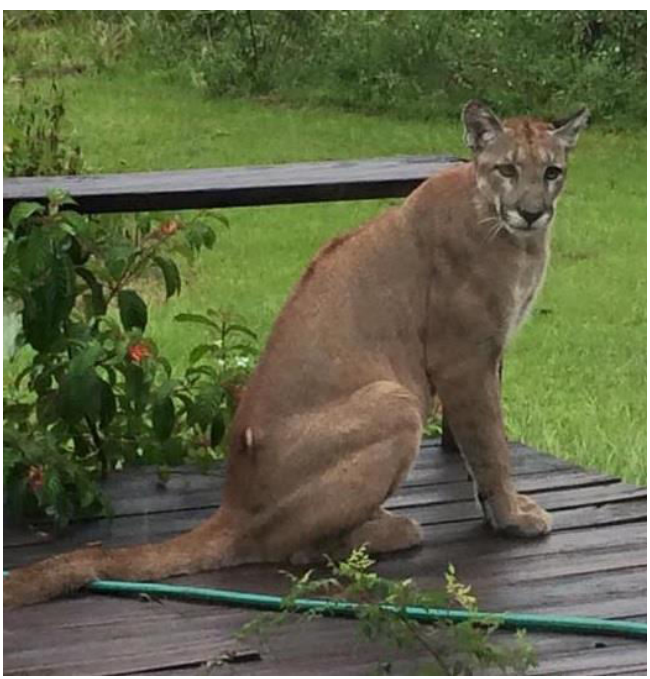
Figure 1. Panther on a back porch in Golden Gate Estates

Florida panthers are secretive and encounters with humans are rare. As secretive as panthers are, occasionally someone gets a good look at a Florida panther. Haley Price only had to look out on her porch in Golden Gate Estates last month and has a nice picture and a good story to boot (Figure 1).